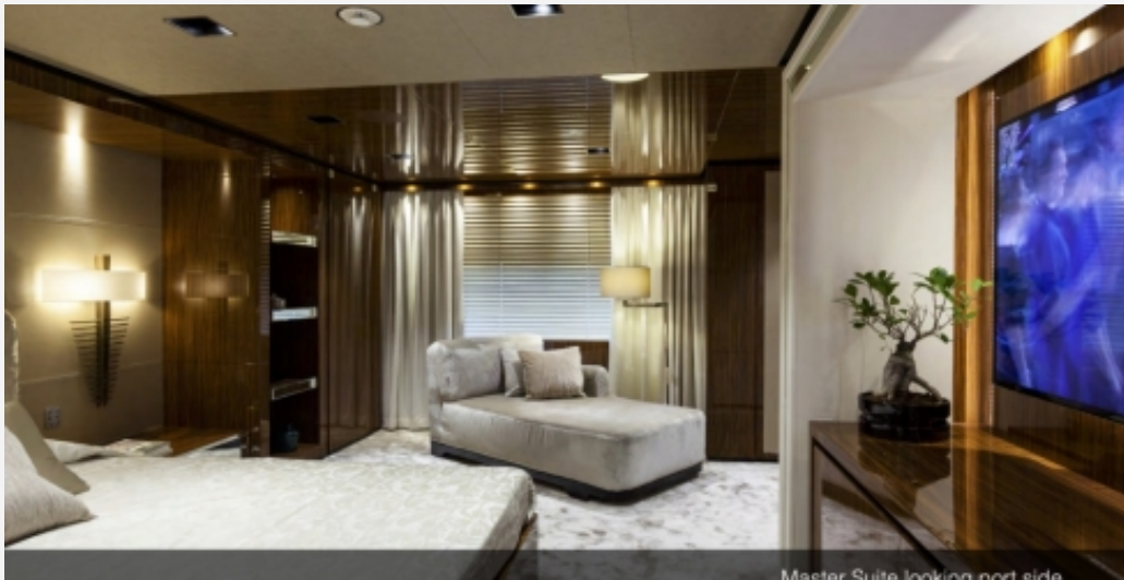
Master Suite looking port side