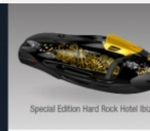
Special Edition Hard Rock Hotel Ibiza