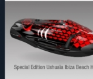
Special Edition Ushuaia Ibiza Beach Hotel