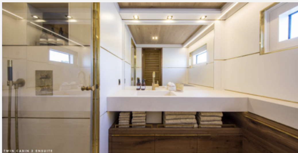
TWIN CABIN 2 ENSUITE